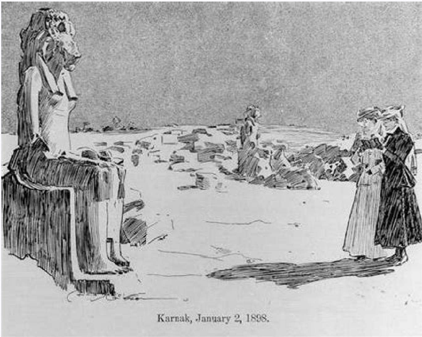
Karnak, January 2, 1898.